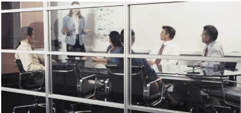
County Increases transparency and innovation through open data